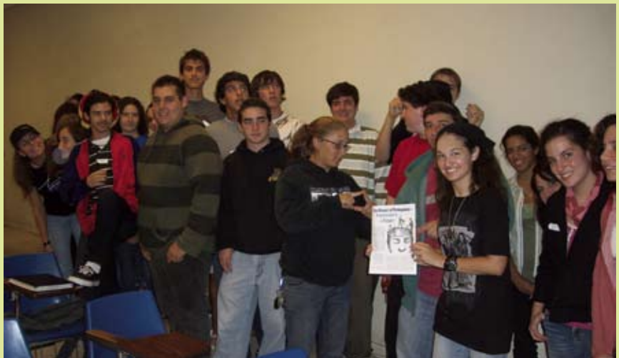
College students from the University of Florida and high school students from Los Angeles Hebrew High recently heard Jews for Judaism presentations. These students agree that peer-to-peer student proselytizing is a growing challenge on campus and Jews for Judaism programs help keep them Jewish.